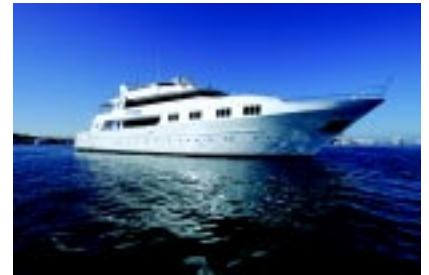
Blue Horizon is being used in the HEPCA initiative

Hayah reef clean-up safaris will be running throughout January with blue o two, visit www.blueotwo.com for more details. appreciate.