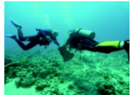
Making a difference below the waves