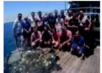
The happy rubbish collectors