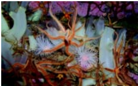
P30 MCS Update