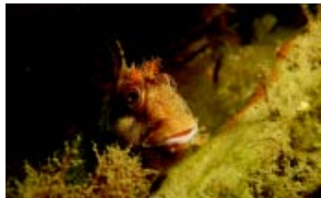
P14 tompot blenny