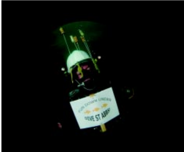
MHS 2nd - Sam Bean