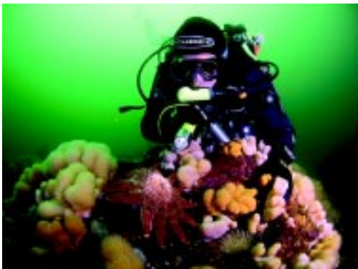
RA 1st - Diver looking at a sunstar on a reef by Cathy Lewis