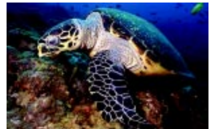
Stunning marine life (turtle)