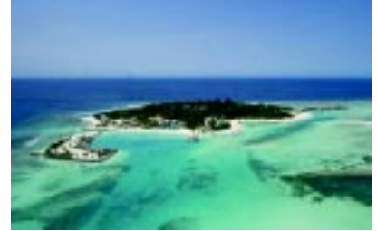
South Male Island

appreciate. We were therefore very happy to be named as Kandooma's only dive specialist tour operator for the UK.