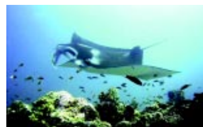
Did we mention stunning marine life? (stingray)