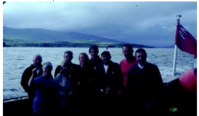
We made it!

On our steam back to Oban, I took time to reflect on the trip. The diving at Kilda, even in less than perfect conditions, had been amazing. Those three dives were like an appetiser enticing me back for more.