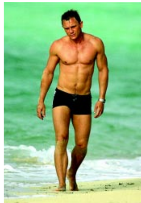
Daniel Craig looking buff on the beach

● It gives you the freedom to explore where few others go.