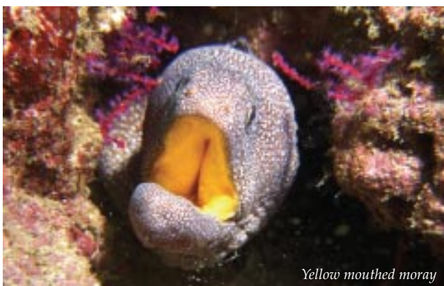
Yellow mouthed moray

For more information on diving in Oman with Dive Worldwide visit www.diveworldwide.com ; call 0845 130 6980; or email: sales@diveworldwide.com