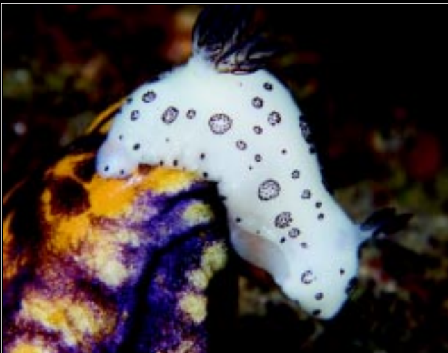
Jorunna funebris , Kabui Strait