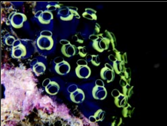
Colonial sea squirt