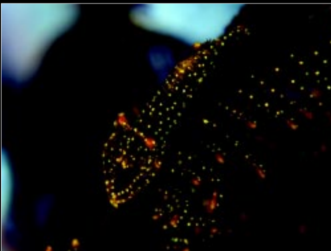
Periclimenes amboinensis on crinoid