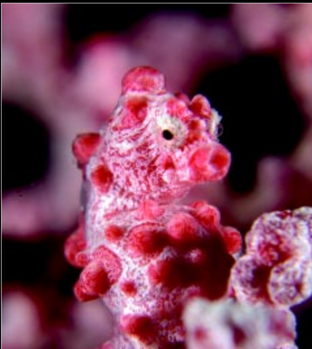
Pygmy Sea Horse, Hippocampus bargibanti 1 of 12 on a sea fan at 15m