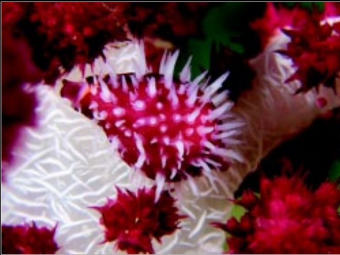
Pseudosimnia punctata on soft coral in the Kabui Strait