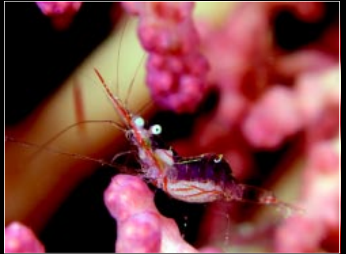
Unidentified shrimp on a sea fan