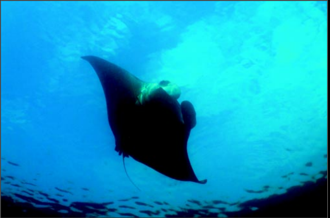
Manta birostris at Aer Borei reefs