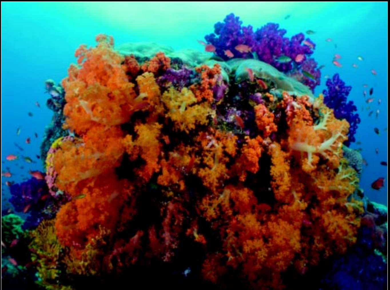
Soft corals and reef fish at Api Box dive site to the south of Gam Island