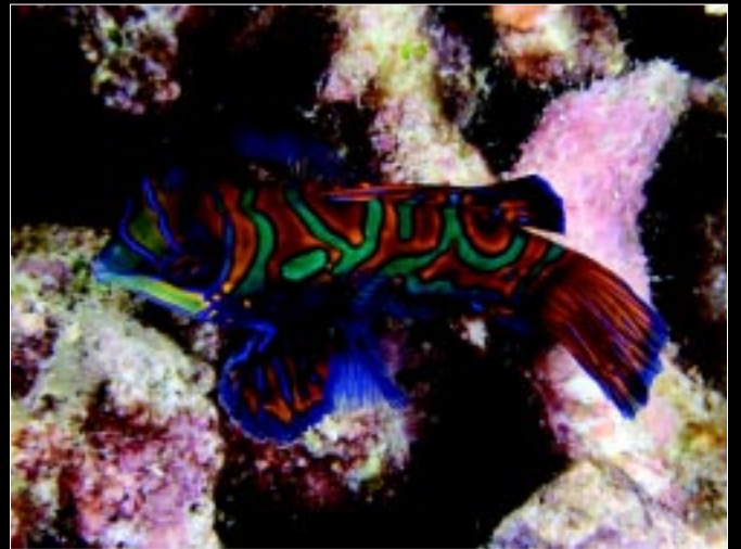
Mandarin fish, Synchiropus splendidus , at dusk at Aer borei Jetty in 6m