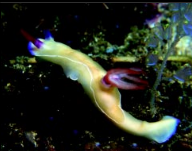
Hypselodoris bullocki , Kabui Strait