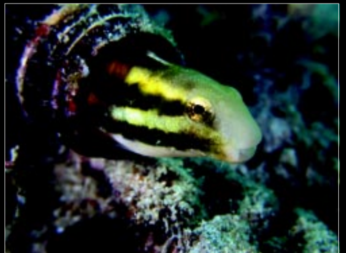
An unknown goby in its discarded bottle home below Aer borei Jetty