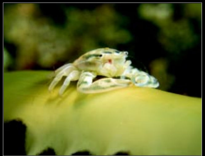
Porcellanella triloba crab on a sea pen during a night dive