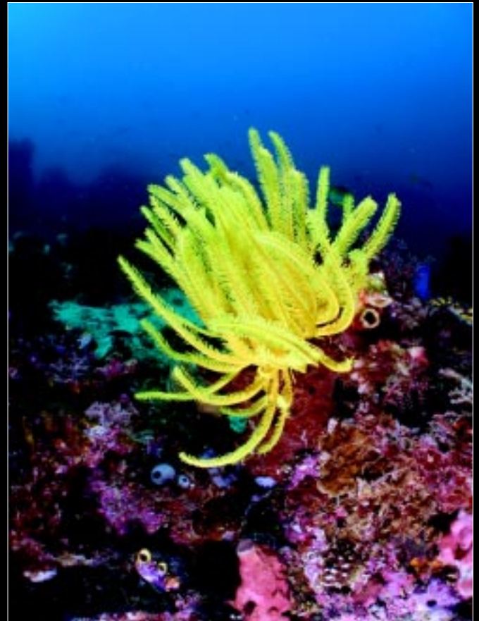
Crinoid starfish Mios Kon, Kri Island