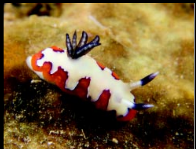
Chromodoris fidelis , Kabui Strait