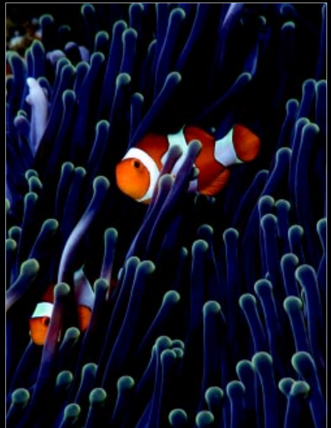
Amphiprion ocellaris in host anemone