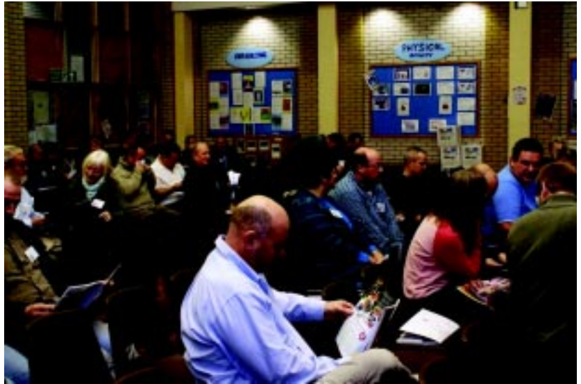
Divers get ready for one of the sessions at the Oban conference

He showed us how it is now possible to map contours in the seabed as well as wrecks and features that stand clear of the bottom. Images of the seabed