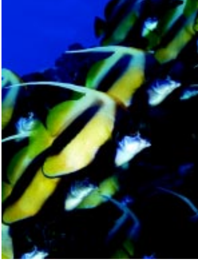
This is what you see when you get to the Red Sea.