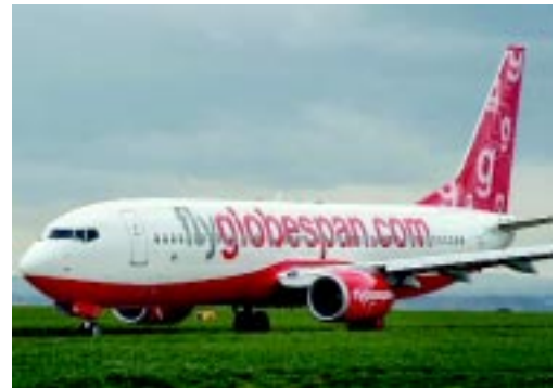
This is how you get there

"I am sure our new customers will enjoy the flyglobespan model and look forward to expanding our programme in the future to include more destinations that will appeal to them."