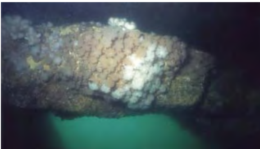
Image left: Cathedral Rock - one of St Abbs' most popular dive sites

At any other times it's 'donation only' and there is an honesty box at the Harbour Master's office. The local council car park is in the middle of the harbour, and the charges vary depending on the length of your stay and time of year. The maximum charge is £10 per day for Saturday, Sunday or Monday. There is also a small amount of parking on the top road overlooking the harbour which is free.