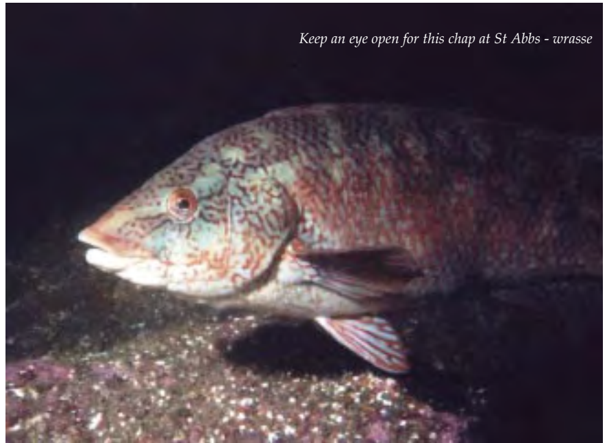
Keep an eye open for this chap at St Abbs - wrasse

The Harbour, St Abbs TD14 5PW Bed and Breakfast Light snacks and refreshments available (outdoor seating only) 01890 771477