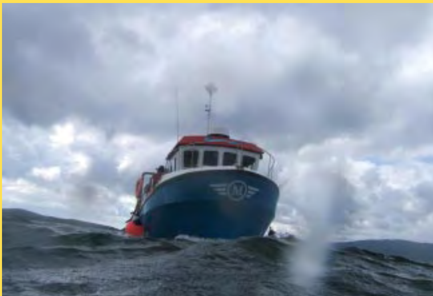
Little Blue is here; where did the blue sky go