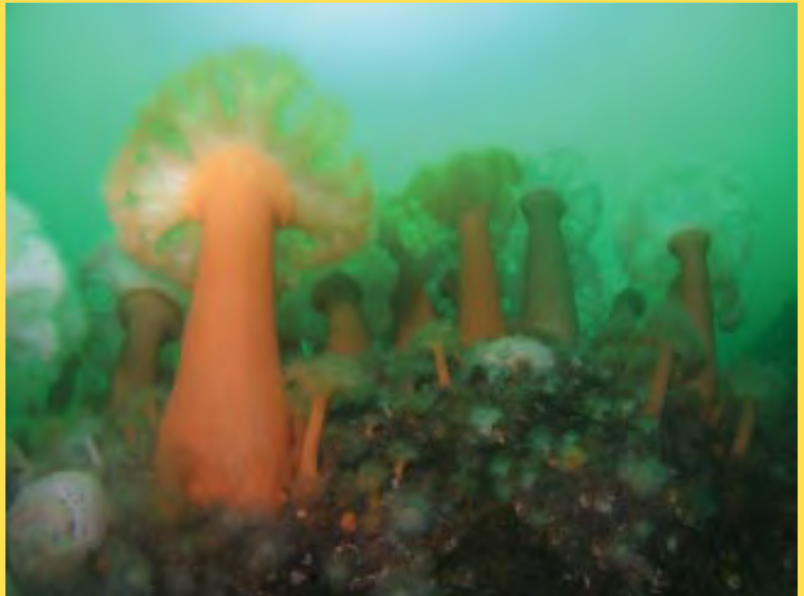
Metridium plumose anemones provide a ghostly underwater architecture