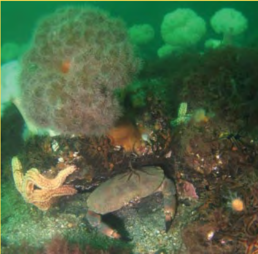
edible crab and anemones