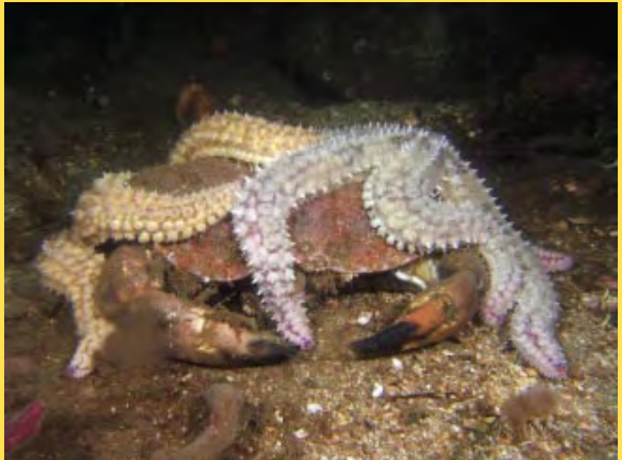
Excuse me - I'm having my lunch! Starfish finds the crab to his satisfaction