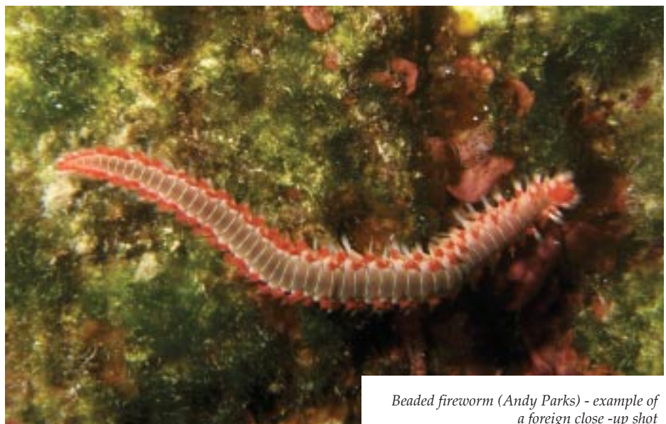
Beaded fireworm (Andy Parks) - example of a foreign close-up shot