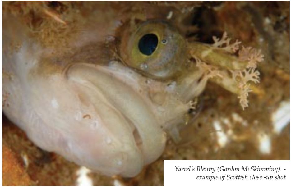
Yarrel's Blenny (Gordon McSkimming) - example of Scottish close-up shot