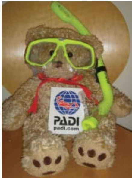
Bosie looking cute in snorkel and goggles