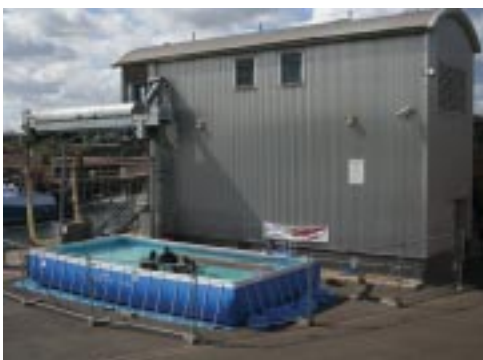
Aquastar's try-a-dive pool