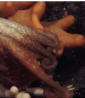
d of St. Abbs Head. After as just started to uncurl its Nikon F90x with 60mm lens