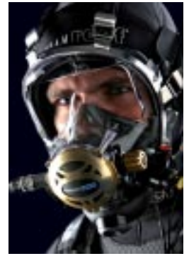
The new Predator mask

For more information visit www.sea-sea.com