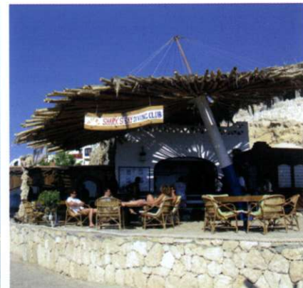
Sharks Bay - Bedouin Village