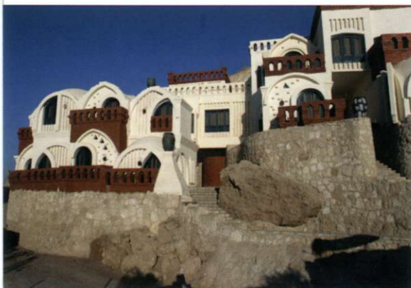
The Dive Centre

For further details contact Onas on 01323 648924, web: www.onasdivers.com