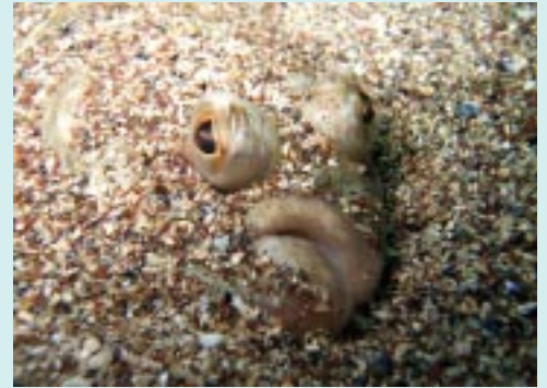
close up of a flat fish - Steve Bateman