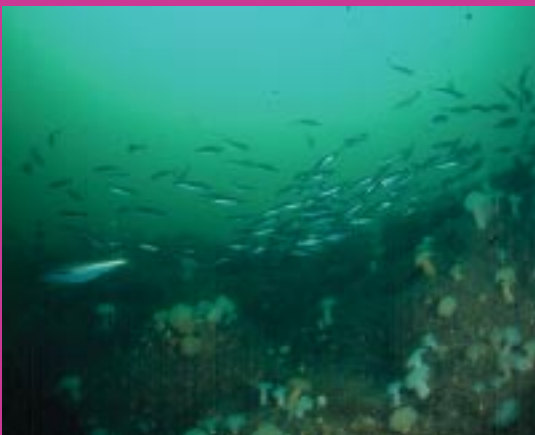
a shoal of coleys swimming over a reef - Peter Ladell