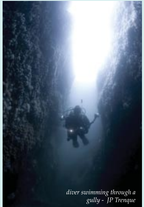
diver swimming through a gully - JP Trenque