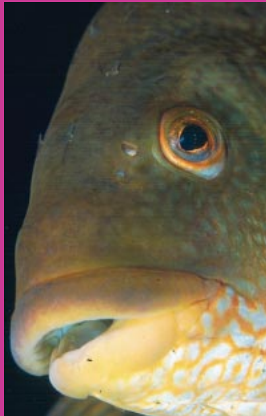
close up of a ballan wrasse - Jason Gregory