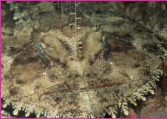
close up of an angler fish - Bill Hewitt