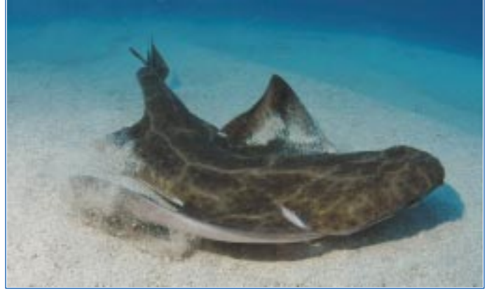
now extinct angel shark - Simon Rogerson

• Deepwater sharks reached the headlines in autumn last year following an exposé of the unregulated deepwater gillnet fishery off the NW coast of Scotland. Following pressure from the conservation sector the fishery was closed, however the fate of these sharks hangs in the balance, with no legal protection they are still vulnerable to other fisheries.