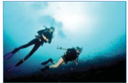
Do what you love doing and make a difference on Coral Cay trip

Lastly there is Danjungan Island located in the Sulu Sea, 3km west of Negros Occidental. The island was established as a Marine Reserve and Wildlife Sanctuary in 2000. You will spend 10 days on this stunning island, with three scheduled