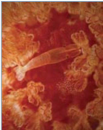
Reclining Emperor Shrimp (Malcolm Hey) - highly commended in the underwater world section

IT'S THAT time of the year again - time to get snapping whilst out diving in a bid to win the Underwater World category in the Shell Wildlife Photographer of the Year competition.