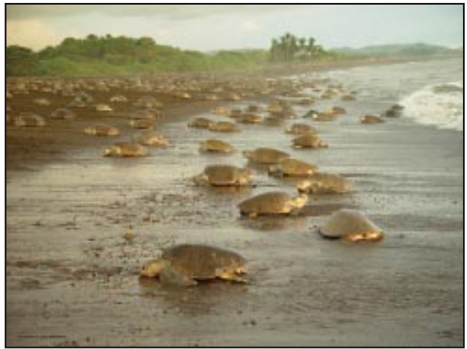
The egg laying ritual of the giant Leatherback turtle is a highlight of Diveworld's Costa Rica diving package

become nesting sites for the giant Leatherback Turtle and divers get to witness their egg-laying ritual, one of the natural world's most remarkable spectacles.