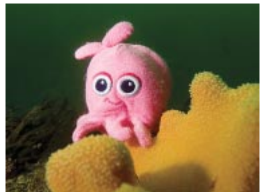
Images this page above top to bottom: 2nd Most Humorous (digital) - (Libby Bower); 2nd Most Humorous (film) - (C Scatchard); 1st Most Humorous (digital) - (Ken Sullivan).