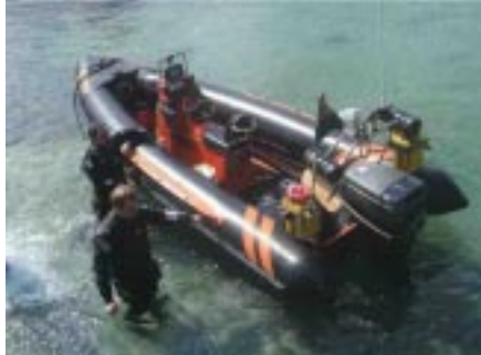
I hope Calum Duncan doesn't read that bit about commandeering the RIB (editor)

We re-laid the shot and hit the wreck and the others followed with two good dives on a very pretty little wreck. Unfortunately the wind and current picked up a bit and the first wave definitely got the best conditions. The