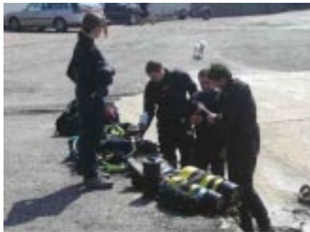
The scenario sessions were well prepared

Flash Card task system seemed to work well and the candidates were all on their best behaviour, passing without too much difficulty.