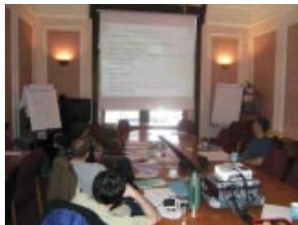
Saturday's lecture sessions were a tough gig

The plan on Sunday was to dive a wreck in Cullen Bay at 30m. The weather forecast midweek had not been too clever but the weather gods were kind to us and Sunday was fine for most of the day. We needed boats of which Grampian Branch has two RIBs, one was promised to a Seasearch