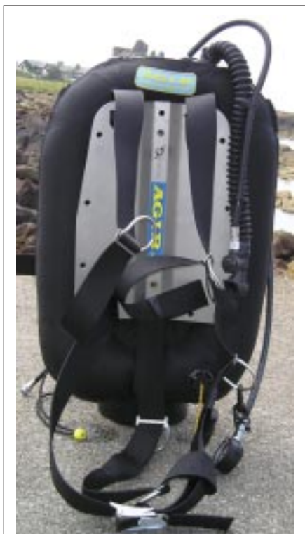
Agir-Brokk's Blackbird 36, according to our reviewer, is robust and comfortable and comes with some interesting extras

At present there is no distributor in Scotland but there is one in England and you can always order one direct from Agir-Brokk in Sweden. They have a wide range of equipment on their website: www.agir-brokk.com which all looks as good as the Blackbird wing.