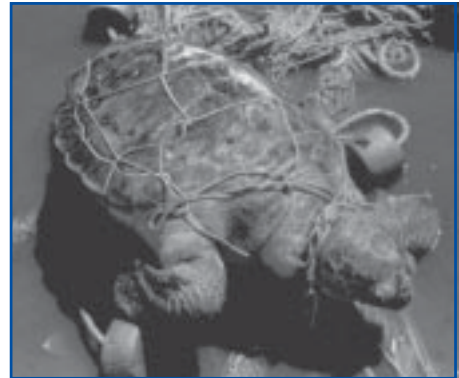
There are many dangers to marine

During last year's MCS Beachwatch 2004 weekend, over 3,000 volunteers took part, cleaning and surveying 269 beaches, and collecting over a quarter of a million items of litter, a clear signal that clean beaches are a matter of high